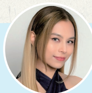
李幸倪 Gin Lee

分享發展事業的成長經歷 To share their stories in pursuit of career development